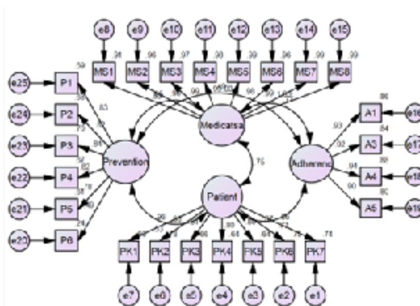
Figure 2: CFA