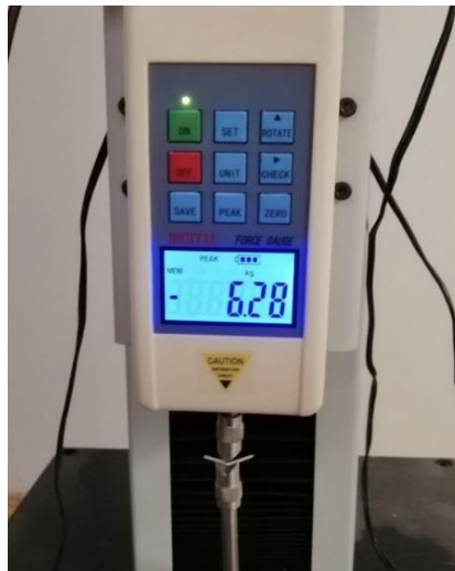
Fig. (1): Specimen under load in universal testing machine

10% HF had adverse effect on flexural strength of glass fiber post for both application times. 24% H 2 O 2 and chloroform can be used for fiber post surface treatment without decreasing its flexural strength, but higher concentrations of H 2 O 2 (35%) require shorter times to avoid affecting its mechanical properties.