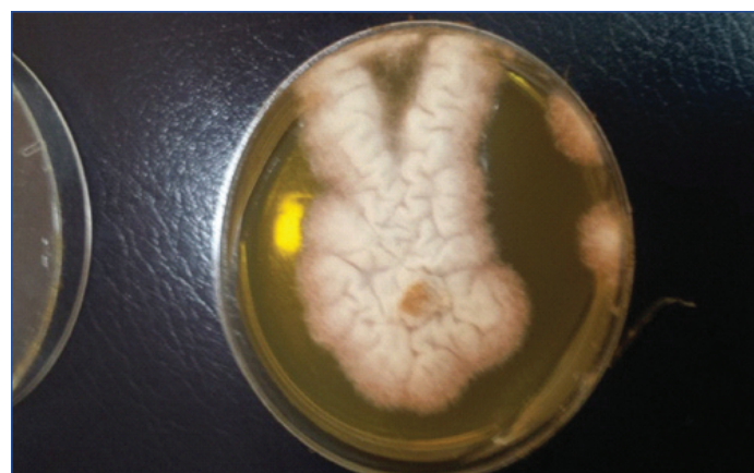
[Table/Fig-2]: Fusarium oxysporum : white colony turned pink in colour on SDA medium.