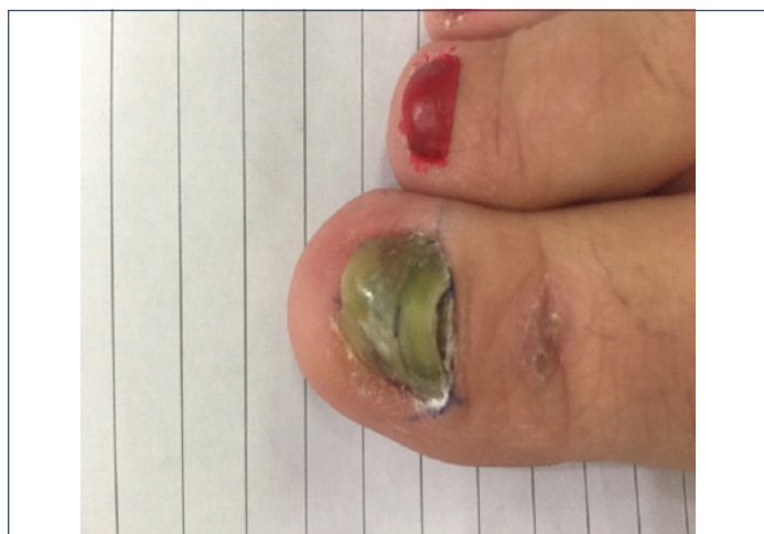
[Table/Fig-1]: Dystrophic changes in the nail plate and extensive yellowish-green discoloration of large first toenail.

(SDI) (250 mg/L), and cycloheximide) (Sigma-Aldrich) (500 mg/L), and one slant of SDA contained antibiotics but without cycloheximide, which were incubated at 30°C and examined after seven days for fungal growth. The mycological test of the case, which included direct KOH examination before specimen culture was considered positive for the right first toenail. This was evident by presence of numerous hyaline branched and septate hyphae and reproductive structures suggestive of chlamydospores. Microscopic mounts were made in Lactophenol Cotton Blue (LPCB) from the white, cottony culture which later turned pink in colour examined after 10 days incubation on SDA at 30°C. The causative agent was identified as Fusarium oxysporum according to The Fusarium Laboratory Manual [Table/Fig-2,3] [2].